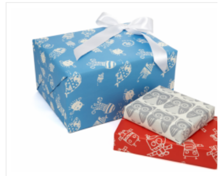
— The paper is a gift all on it's own!

My wife. She has taught me to like things I never liked before knowing her. She has made me realize that there is so much to live for in life. I can't imagine having to live in this world without being able to share it all with someone. I've always wanted to know the point to living; if no one was there to experience it with you.