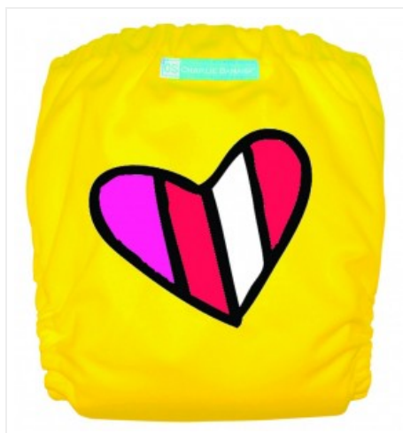
— Charlie Banana for one and all!