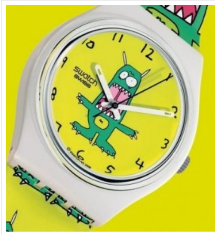
— Swatch out!

To this day, nothing can trump the work I did with Swatch. They were a blast to work with and the artistic freedom they gave n with the way they embrace artists is truly inspiring to see in the corporate world.