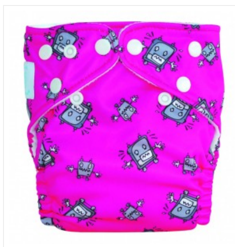
— Charlie Banana for the little ladies!

There are so many. I have recently designed prints for a cloth die company which is really fabulous called Charlie Banana . You can see them here . I am also working with an awesome Swedish company now called FabGoose. Stay tuned to my blogs to see what we're doing.