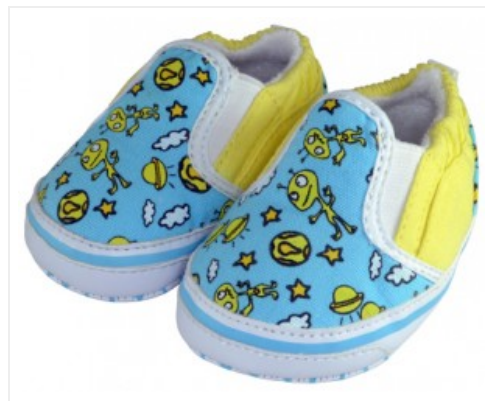
— Ummm.. how cute are THESE!?! (shoes available through Neon Eaters)