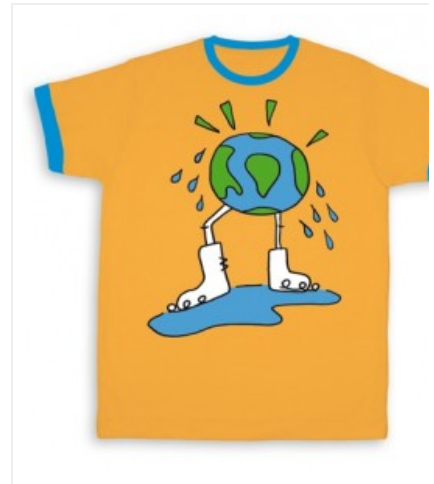
— T-t-t-t-tEASIN' Me!