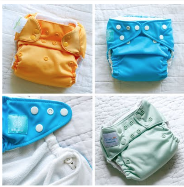
(Bumgenius, Charlie Banana One Size, detail of leg elastic and an Oh Katy)

The Bumgenius come with a regular insert (it has snaps to adjust the size) and a newborn insert (a thin insert). The Oh Katy comes with the same inserts as the Bumgenius. The sized Charlie Banana's come with 2 normal inserts. It's nice having extra inserts for when some are still drying or when I want to put them in other diaper covers.